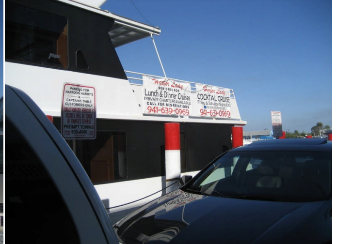
The Harbor Lady