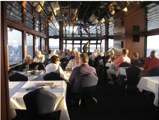
Members and Guest of the Military Museum